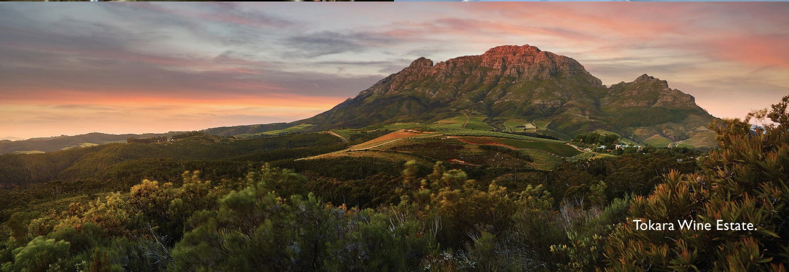
Tokara Wine Estate.