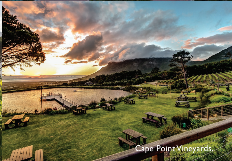
Cape Point Vineyards.