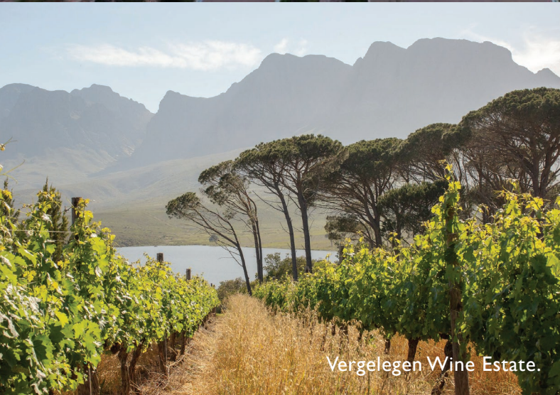
Vergelegen Wine Estate.