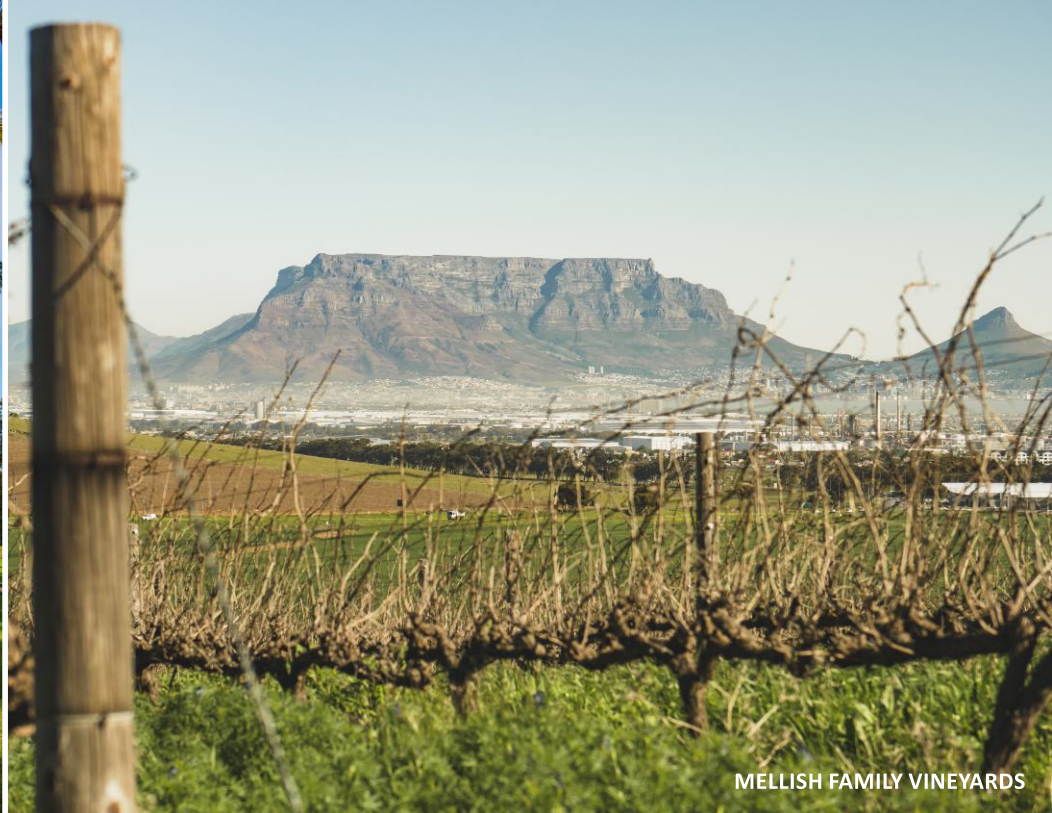
MELLISH FAMILY VINEYARDS