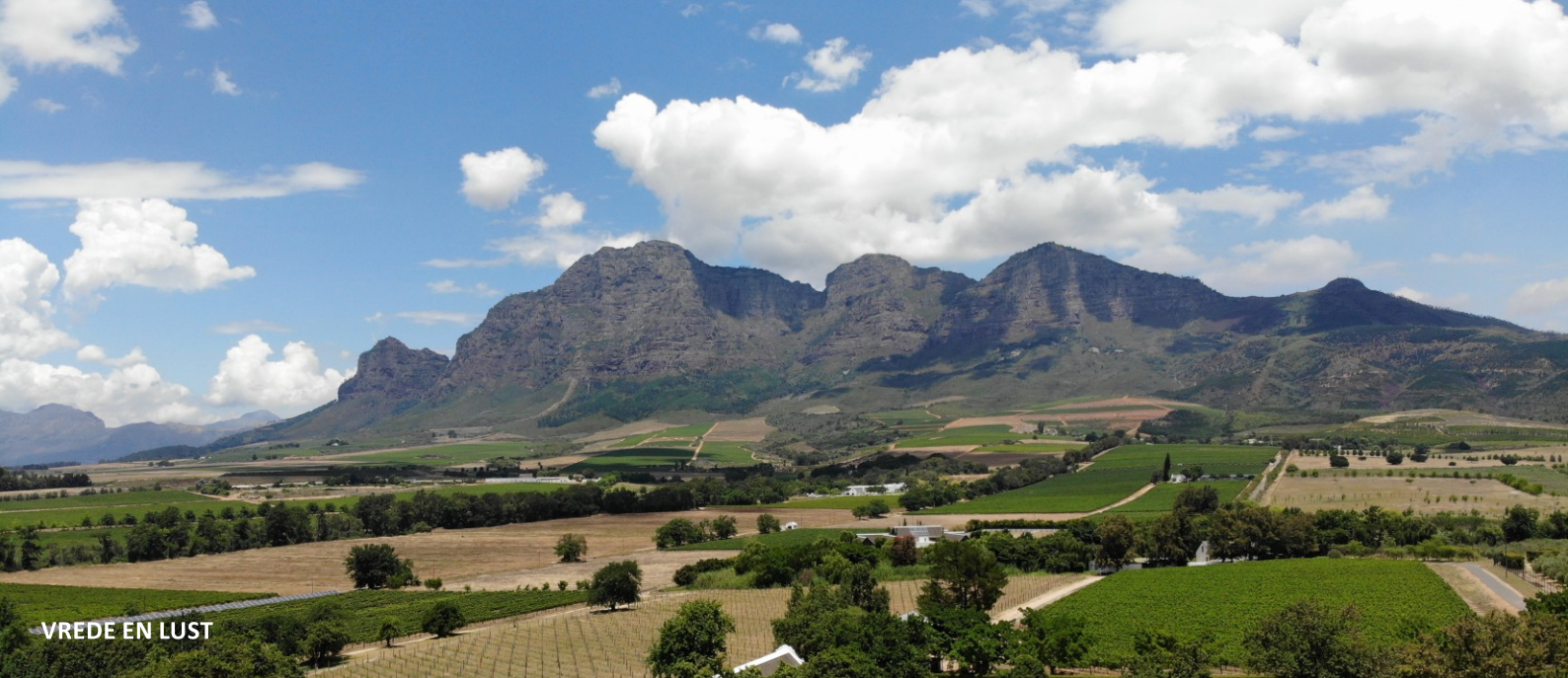
VREDE EN LUST