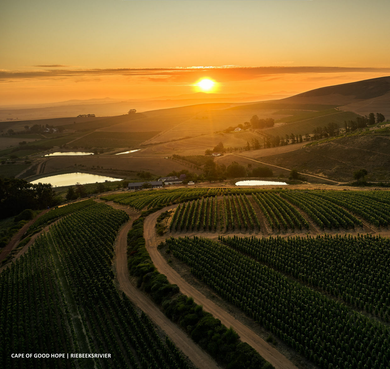
CAPE OF GOOD HOPE | RIEBEEKSRIVIER