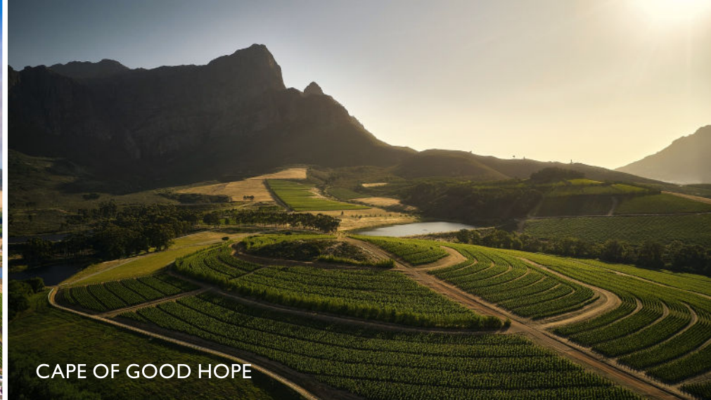
CAPE OF GOOD HOPE