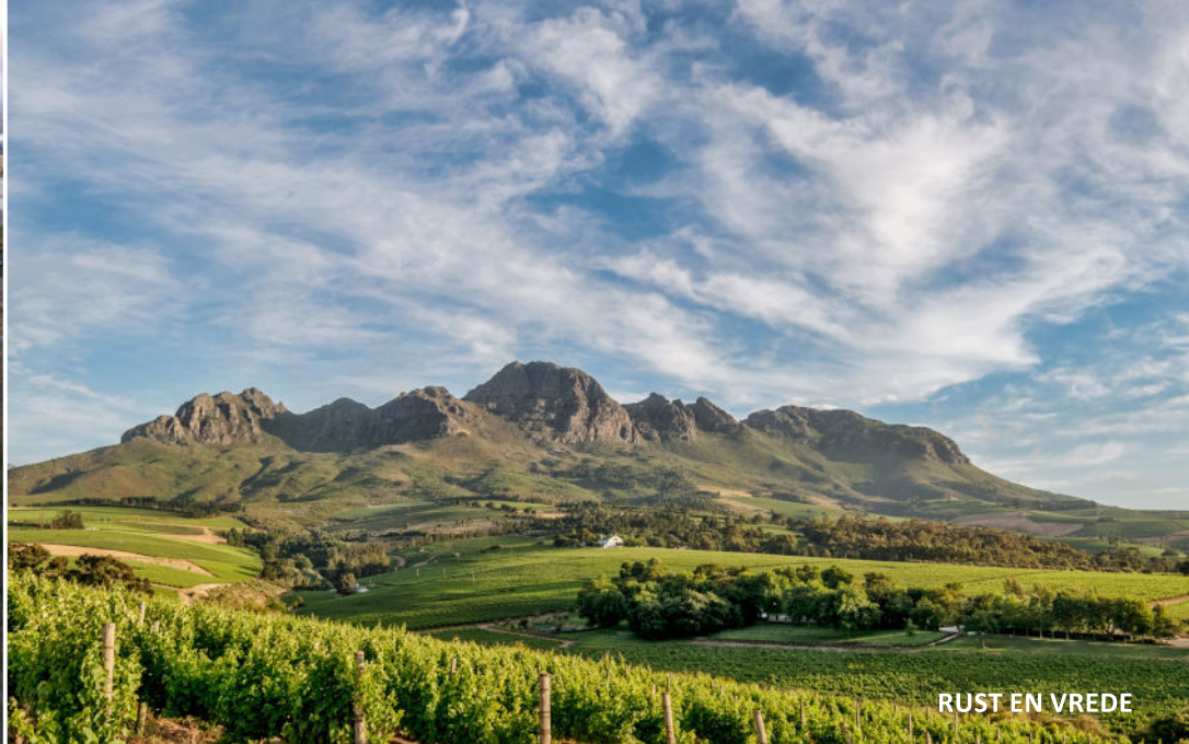
RUST EN VREDE