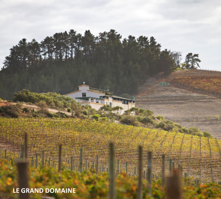
LE GRAND DOMAINE