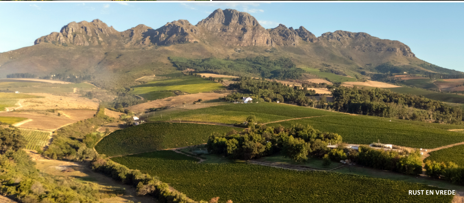
RUST EN VREDE